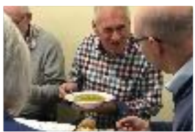
Eating together at harvest.

Belong - we belong to Jesus and so we belong to one another. We believe this family is open to all who would turn from sin and self-reliance and put their trust in Him and so we welcome everyone with the radical loving kindness of Jesus and trust the Holy Spirit to convict and lead us into God's best for our lives. We love having fun, eating together and spending time with one another across the generations. Our church life is punctuated by Bring & Share, Prayer Breakfasts, Work Parties (with chips) and Life Groups where we can learn to be family together.