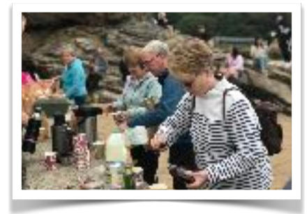
Prayer Breakfast on Coppet Hall Beach before our summer Beach Mission in 2019