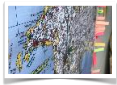
Praying for our county at our 24-7 prayer.