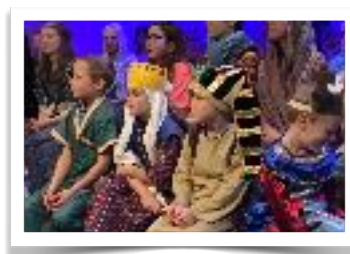
Children taking part in our 'One Story' Christmas musical outreach in 2019

Anyone who has repented of their sin, put their faith in Jesus, and been baptised is able to become a member. Membership may also be transferred from another fellowship. We ask that all new congregants spend a year to get to know us before considering membership.