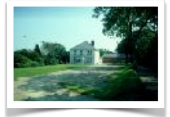
87 Pembroke Road in the early days of the church building (to the right)

In 1983, 87 Pembroke Road came up for sale. God provided all the finance necessary through generous friends and Emmanuel Christian Centre became a reality with the first church service held in the living room following a picnic. Over the years a purpose built building was developed on the site and is now used throughout the week to host worship and prayer meetings and to reach out into our local community.