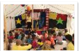
One of our holiday clubs

Grow - we long to grow to know and love Jesus better, to grow in our obedience to Him and to grow to use our gifts to serve Him and each other. We believe each of us is a vital member of the body of Christ. We actively encourage members to develop their gifting and to serve Jesus wherever they find themselves and we seek to equip and enable each other to do this. We believe God is a God of multiplication, and so we expect to multiply disciples, leaders and churches as the Spirit leads and empowers us.