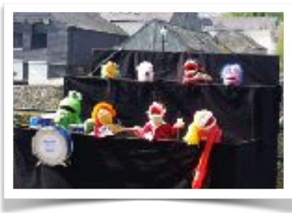
Puppet outreach in Haverfordwest, Easter 2019